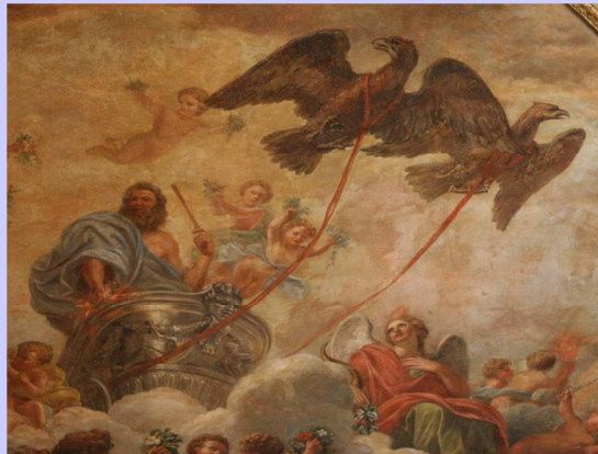
Here we see Jupiter is holding the lightning bolts in his right hand, the Eagles are guiding his chariott, and his sceptre is in his left hand.